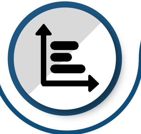
Using Program Data to Demonstrate Impact